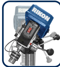
Head Tilts 45° Right and 90° Left